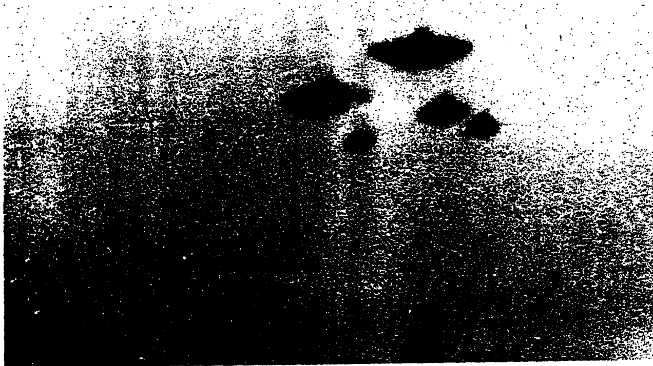
Sheffield, England, 4 March 1962